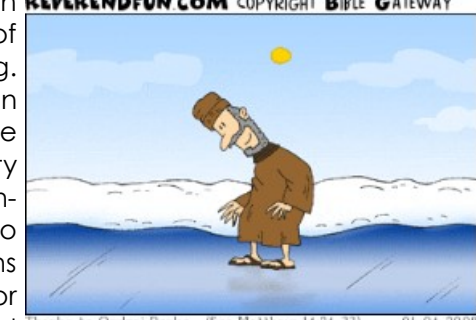
STRONGER IN THE WINTER

population of approximately 85,000 within the region REVERENDEUN COM COPYRIGHT BIFLE GATEWAY of Leduc County, Beaumont, Calmar, Devon, City of Leduc, New Sarepta, Nisku, Thorsby and Warburg. The LDFB provides short term assistance to those in need, and helps build food security within the communities. We would like to take this opportunity to ask you for your support in providing this worthwhile organization with the resources we need to continue delivering invaluable services to the citizens of Leduc and area. By participating as a walker or sponsoring part of the walk will allow the Leduc and District Food Bank to prosper.