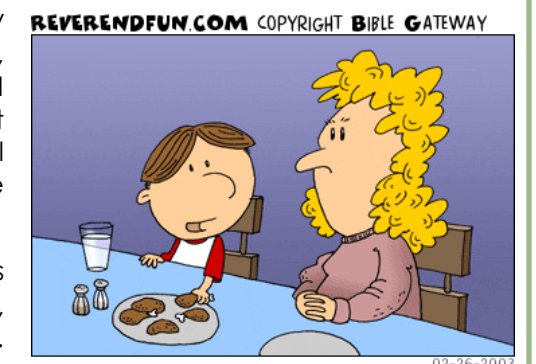
THEY'RE LEFTOVERS ... WE ALREADY BLESSED THEM

LONESOME CHUCKWALLA - Scooter's hero, airplane ace Lonesome Chuckwalla, crash lands into Grandpa's barn in a storm. Subscribe for free at aetkidscorner.com.