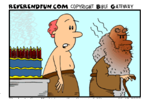
YOU KNOW IT WASN'T TRICK CANDLES METHUSELAH ... JUST A CASE OF TOO MUCH FLAME MEETS TOO MUCH BEARD

WORK. WALK. PRAY. - Resonate Global Mission is seeking a hiking/backpacking intern to work alongside long -term missionaries in West Africa. Hike to remote West African villages and help bring scripture to people in their local language. Learn more and apply at www.resonateglobalmission.org/hiking.