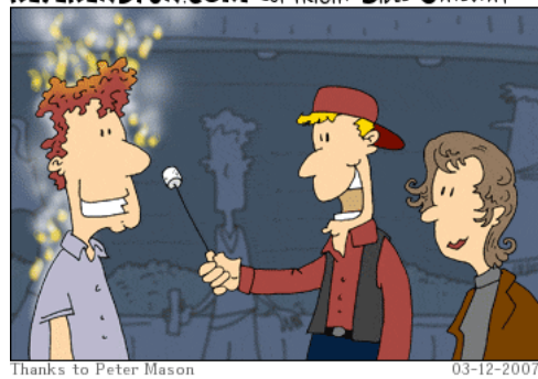
THESE "ON-FIRE CHRISTIANS" SURE COME IN HANDY AT THESE BARBECUES